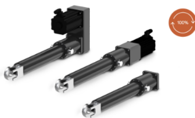
SRSA / SVSA