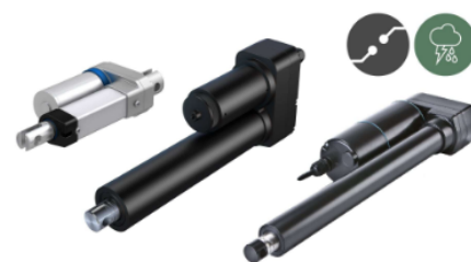
CAHB series linear actuators